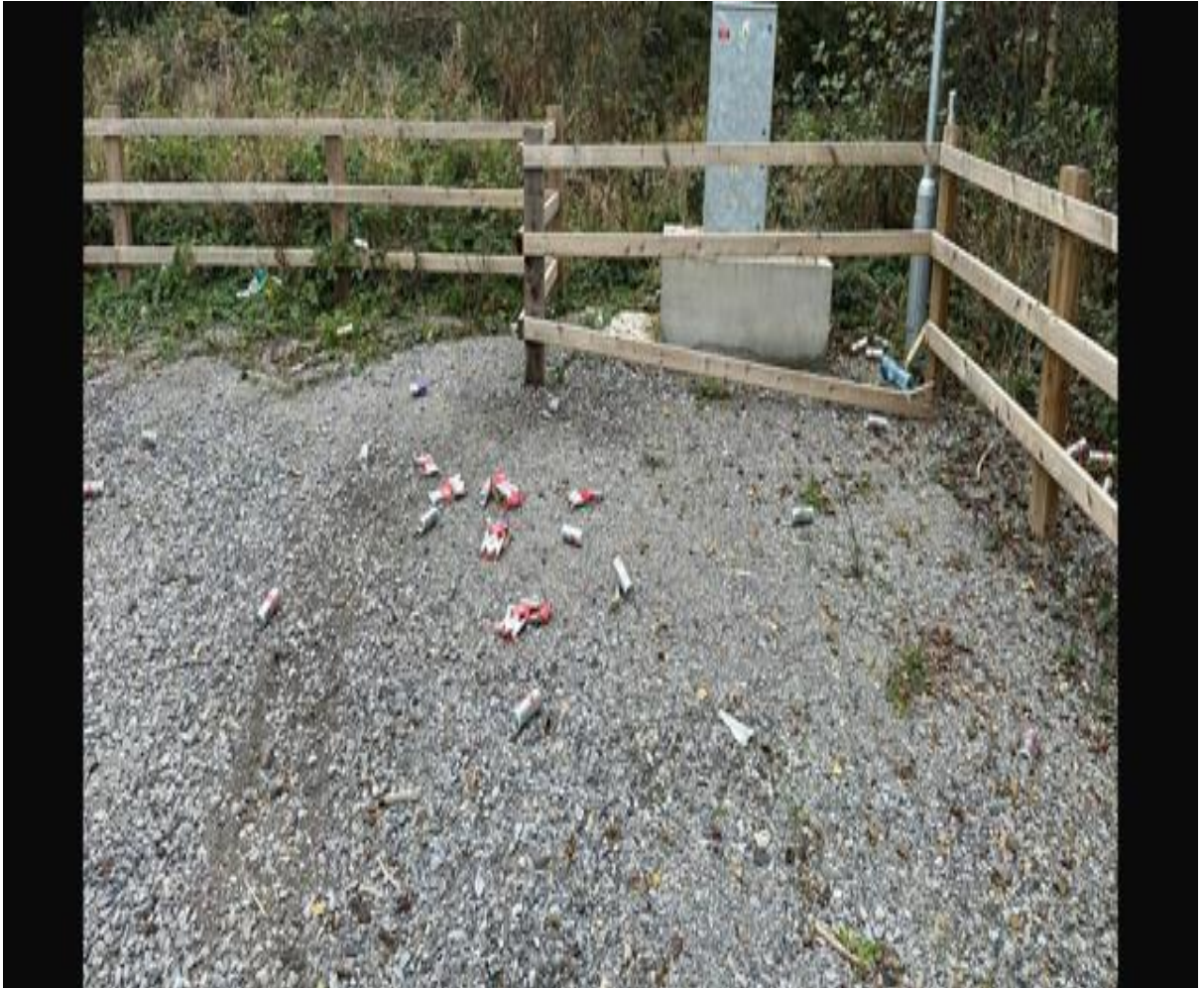
Pic 2- 5: Derrylea Tree Lined Avenue.